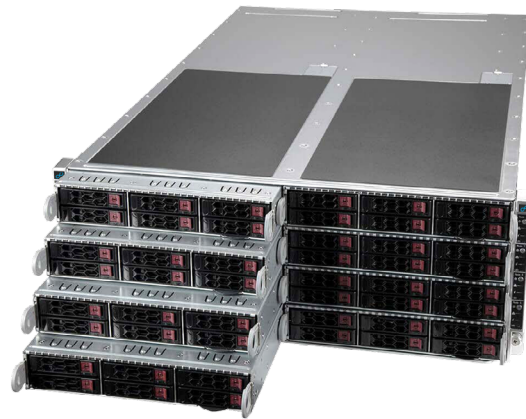
Figure 1. ASF-100 enclosure and nodes.

The ASF-100 storage node is a server node running the PanFS parallel file system. The node has been selected for its form factor, drive accessibility, and overall quality and reliability. The ASF-100 storage node has been configured