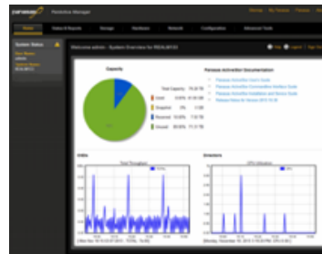
Panasas ActiveStor Manager GUI

Panasas ActiveStor Ultra is a single entity you manage from one graphical user interface (GUI) or command-line interface (CLI), no matter how many ActiveStor enclosures you integrate into it.