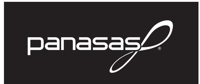
PREFERRED BLACK AND WHITE USAGE — REVERSE APPLICATION